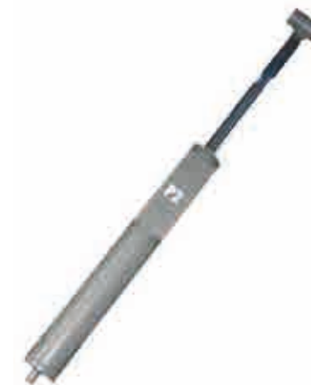
Best quality Cylinders