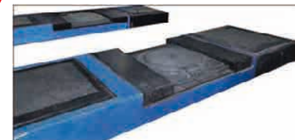
Ready to install turntables for wheel alignment (Optional)

Follow us by your smart device www.boltech.it