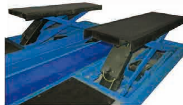
Table lift for run-out compensation procedure in wheel alignment process (Optional)

Best Quality Power Unit To Reach More Life Time And Power